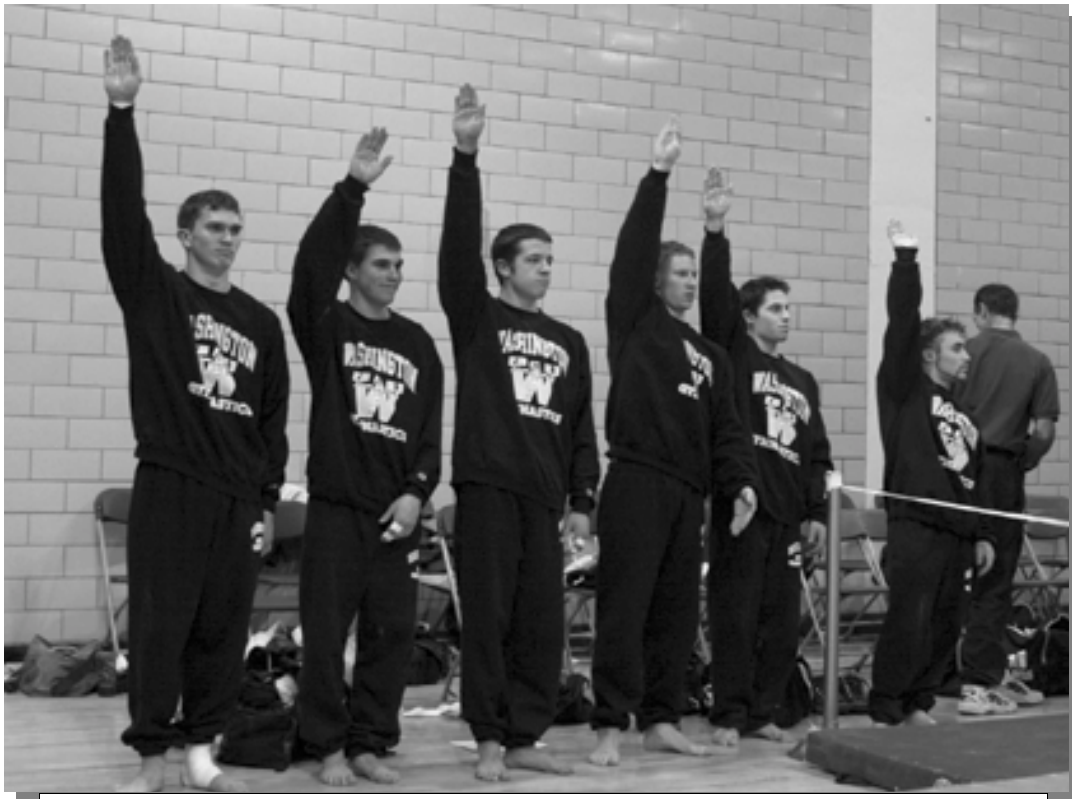
The team after competing at the Air Force Academy.